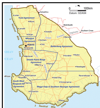
Figure 1 - Map of the South West Native Title Settlement Area and the six Noongar Native Title Agreement Groups that form the six Indigenous Land Use Agreements (ILUAs).

The SWNTS is the largest and most comprehensive agreement to settle Aboriginal interests over land in Australia. The SWNTS area, involving six Noongar Native Title Agreement Groups, is illustrated below.